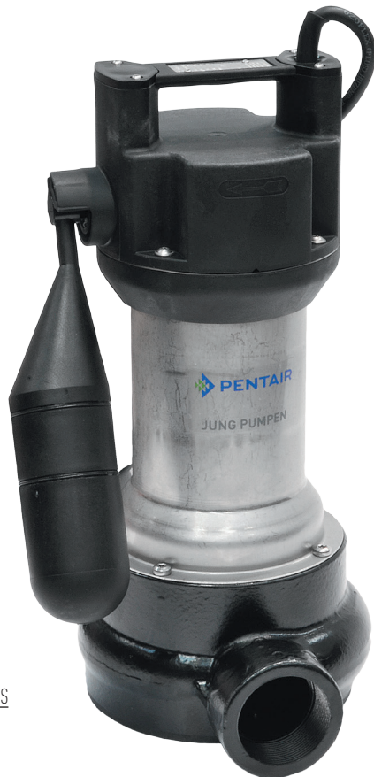
US 103 ES